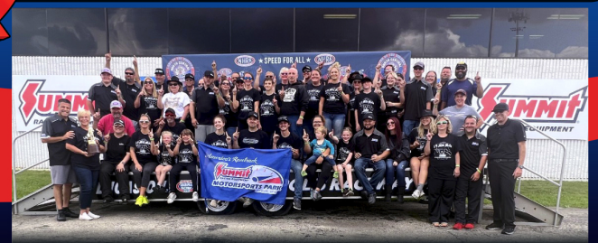
2023 TEAM CHAMPIONS - SUMMIT MOTORSPORTS PARK

BONUS RACES, SPECIAL AWARDS, EVENT SCHEDULE & MORE ON PAGE 2! //