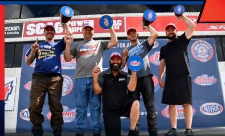
2023 NHRA DIVISION 3 CLASS CHAMPIONS

Each Division Champion earns a WALLY! A Division Champion Jacket! And a Division Champion Gold Ring!