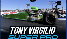
TONY VIRGILIO SUPER PRO