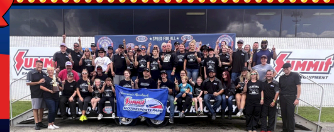
2023 TEAM CHAMPIONS - SUMMIT MOTORSPORTS PARK

BONUS RACES, SPECIAL AWARDS, EVENT SCHEDULE & MORE ON PAGE 2! |||