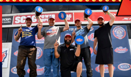
2023 NHRA DIVISION 3 CLASS CHAMPIONS