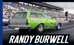
RANDY BURWELL PRO E.T.