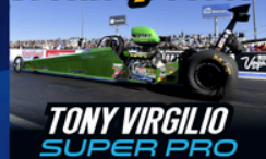
TONY VIRGLIO SUPER PRO